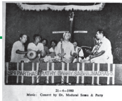
21-4-1980 Music: Concert by Dr. Madurai Somu & Party

Legendary vidwan Madurai Sri Somasundaram, whose birth centenary is celebrated this year, had sent a note on the occasion of the 80th year of Sri Parthasarathy Swami Sabha. He mentions in the note that three generations of vidwans in his guru parampara, Kanchipuram Sri Nayana Pillai, Chittoor Sri Subramania Pillai and Somasundaram himself had performed in this sabha. He fondly recollects the days of his singing with his guru Chittoor Sri Subramania Pillai and his continued association with the sabha. THREE GENERATIONS including Shri Madurai Somasundaram have performed in the Sabha. Legend Vidwan Shri. MADURAI SOMU wishing our Sabha during our 80th year Celebrations in the year 1980. wanted to share on the occasion of his Centenary Year Celebrations. 3 Generations including Shri Madurai Somasundaram have performed in the Sabha.